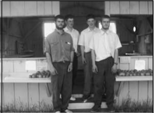
The Boys Bugle staff standing in the doorway of Martin's Roadside Market.

We have long, cold winters. We get approximately 95 inches of snow a year. Usual-