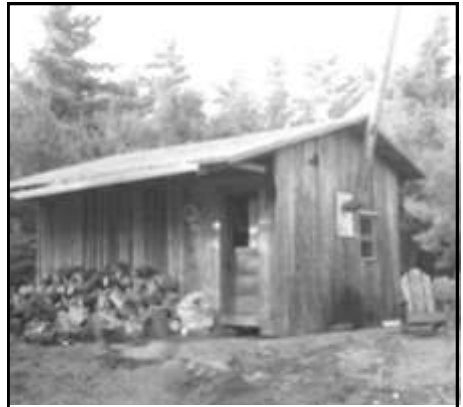
A camp in the woods for visitors.

Please write and/or come visit us sometime.