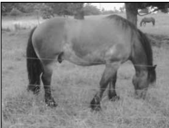
Our best work horse, named Clyde.

Here we have 5 seasons (instead of 4) of the year. There is spring, summer, fall, winter, and then mud season. Mud season is