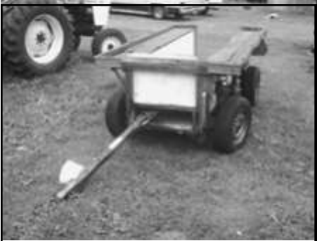
The white suspension wagon that we fabricated out of a car. We bolt shafts on the tongue and hook it to a horse and use it for hauling maple sap.